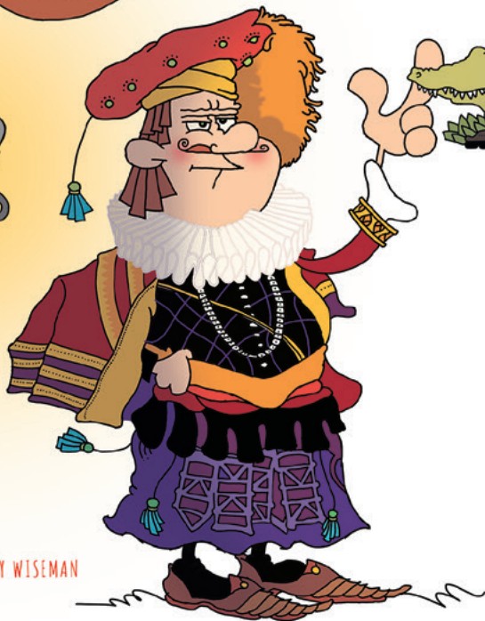
MR. WORLDLY WISEMAN