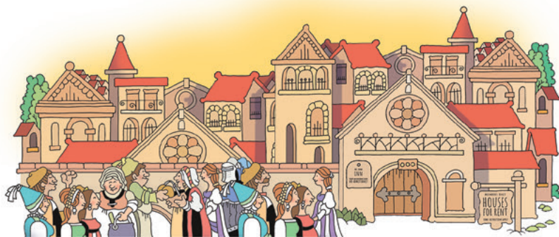
THE VILLAGE OF MORALITY

Worldly Wiseman talks Christian into believing that his heavy burden can be removed quickly and easily by turning off the Narrow Way and traveling to the Village of Morality, where he will receive help and advice that will make his life more practical, happy, and trouble free.